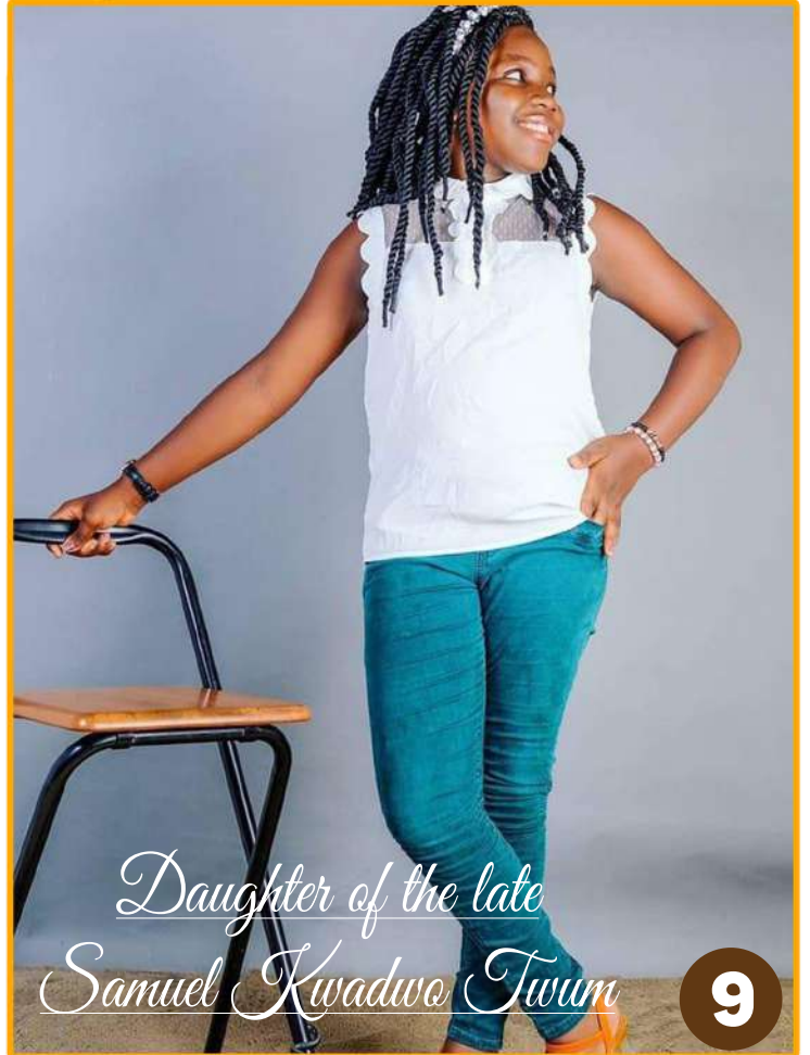
Daughter of the late Samuel Kwadwo Twum